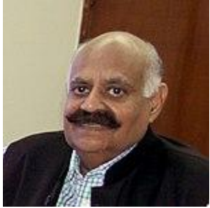
VP Singh Badnore